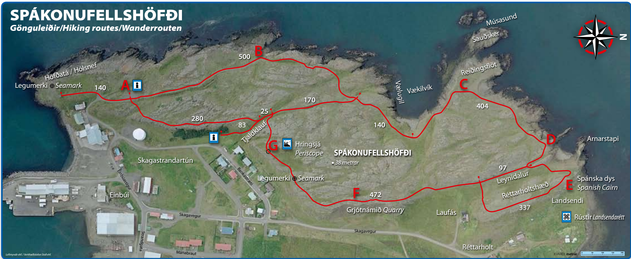
Signs with information on local bird life and vegetation are placed along the hiking paths.